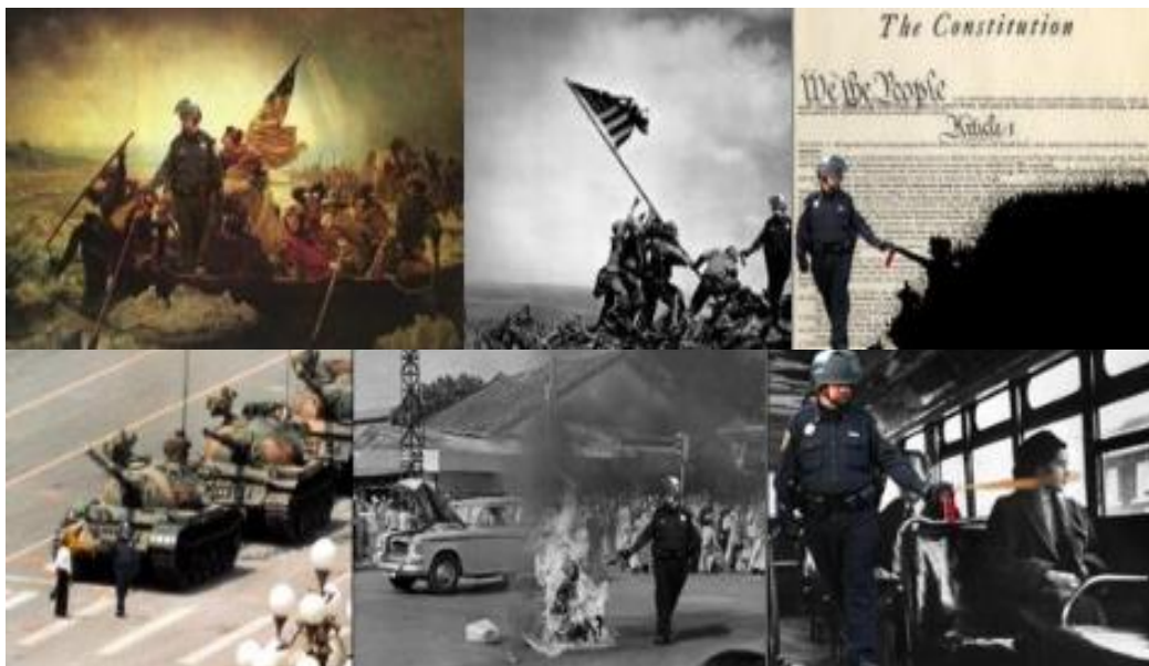
Figure 2. “Pepper Spray Cop” memes

Shifman (2014) notes that memes are heavily intertextual as a medium, relating to one another but also popular culture at large. Milner (2013) argues Occupy memes opened up discussion through appropriating popular culture. Intertextual creations like “Occupy Sesame Street” played on existing associations within audiences. The presence of pop culture increases accessibility and helps to link across strata of society, while also increasing messages’ chances of being shared. Similarly, the “Pepper Spray Cop” meme(s), which used an image of a University of California-Davis police officer nonchalantly pepper-spraying various photo-shopped figures, made use of “interdiscursive” connections to historic events: One set of iterations had him spraying famous activists, such as Tiananmen Square’s Tank Man and Rosa Parks, while another series inserted hallowed American iconography as targets, such as the Constitution, George Washington crossing the Delaware, and soldiers raising the American flag on Iwo Jima (Figure 2). These memes “interdiscursively linked historical events, contemporary news stories, and age-old discussion,” (Milner, 2013, p. 2363). While such connections increased ambiguity about the messages, they made for a powerful, potentially bridging rhetorical style (Dryzek, 2010), and were indispensable in imbuing them with the versatility and recognizability that popularized them.