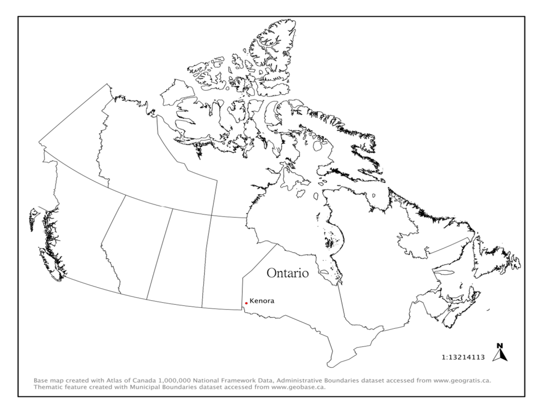
Figure 1.1 – Location of Kenora, northwestern Ontario, Canada

When Europeans first arrived in the Kenora area, they found that the local Ojibway and Cree were a prosperous and relatively unified presence (Freeman 2000). Indeed, through trade and negotiation, there was a period when both broad cultural groups co-existed and shared in what the land had to offer (Cameron 2011); mirroring a sense of inter-cultural accommodation reported elsewhere in the wider region (Berger 1999; White 1991). However, as the settler population grew and the British looked to open up the west of the country, they entered into treaties with Aboriginal people across Canada's central regions. Northwestern Ontario, in particular, was considered a key area as the gateway to fertile farming lands across the Prairies.